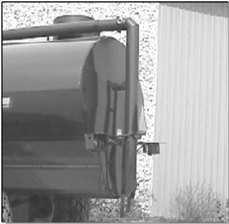
Optional Spread Height 4 FT

6" discharge Up to 2400 gallon per minute adjustable 8" discharge Up to 3600 gallon per minute adjustable 1000 , 540 RPM Fan with hi efficiency blades Timken taper bearings, grease filled chamber double seals, purgeable Constant velocity PTO, shear protected 1 3/8 6T, 1 3/8 21T, 1 3/4 20T Hydraulic drive Optional Up to 60 ft Spreading pattern Discharge height 135", optional 4 ft